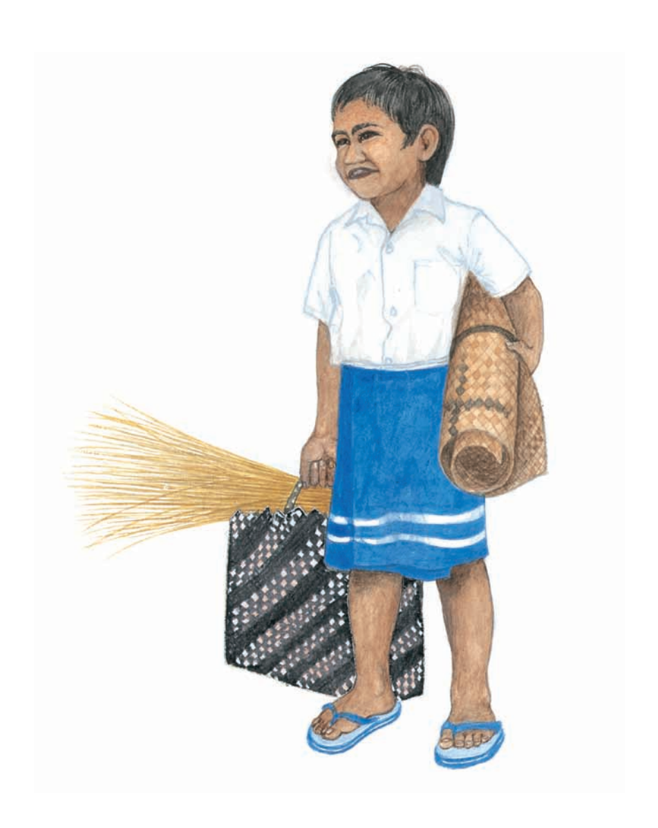
Now I am ready for school.