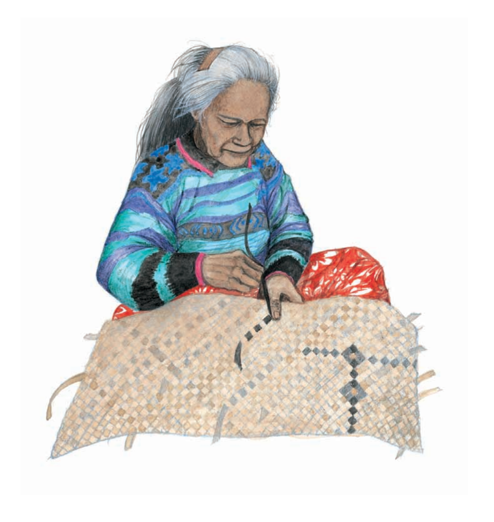
My mother made my basket.