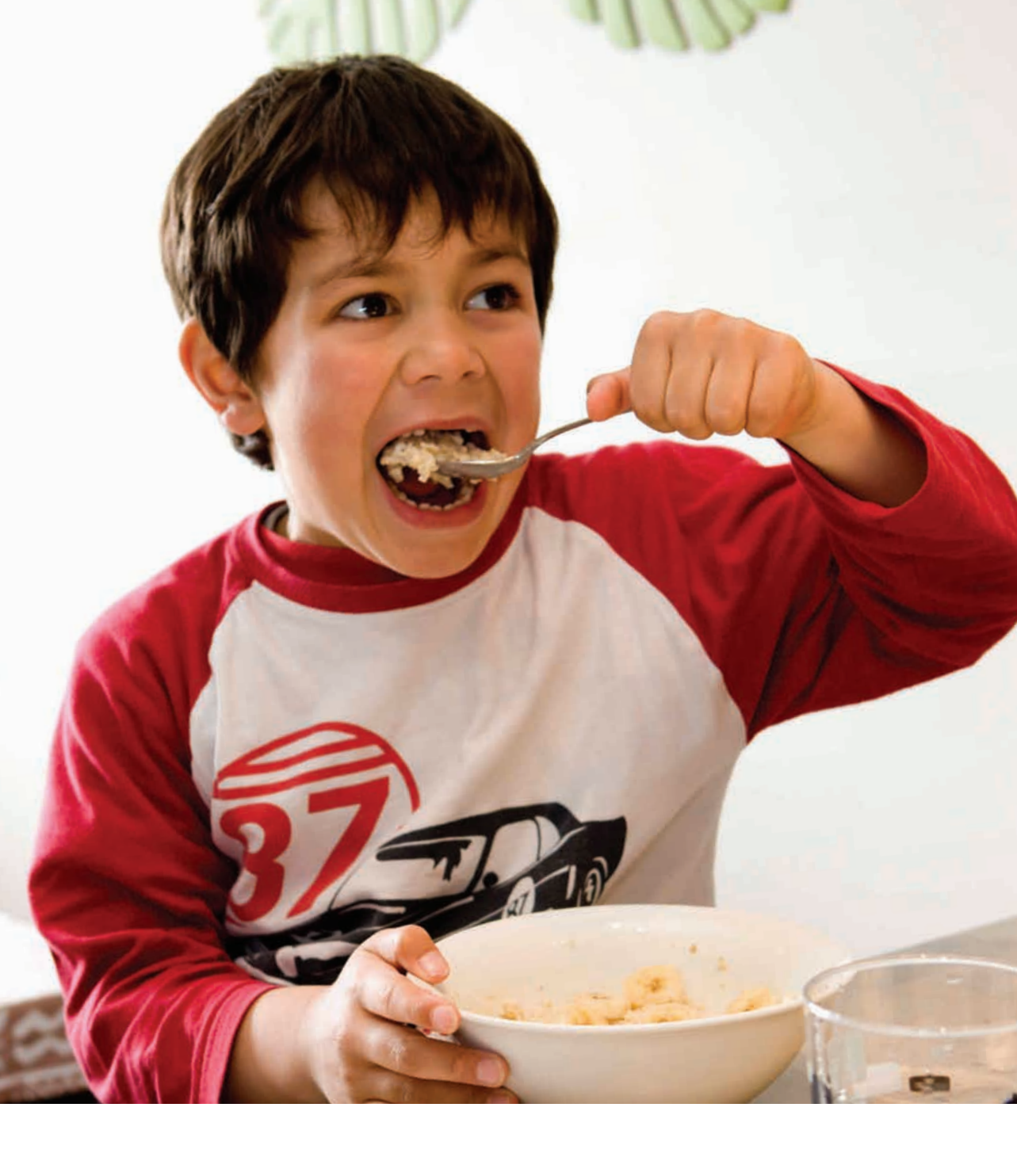
He had a big breakfast.