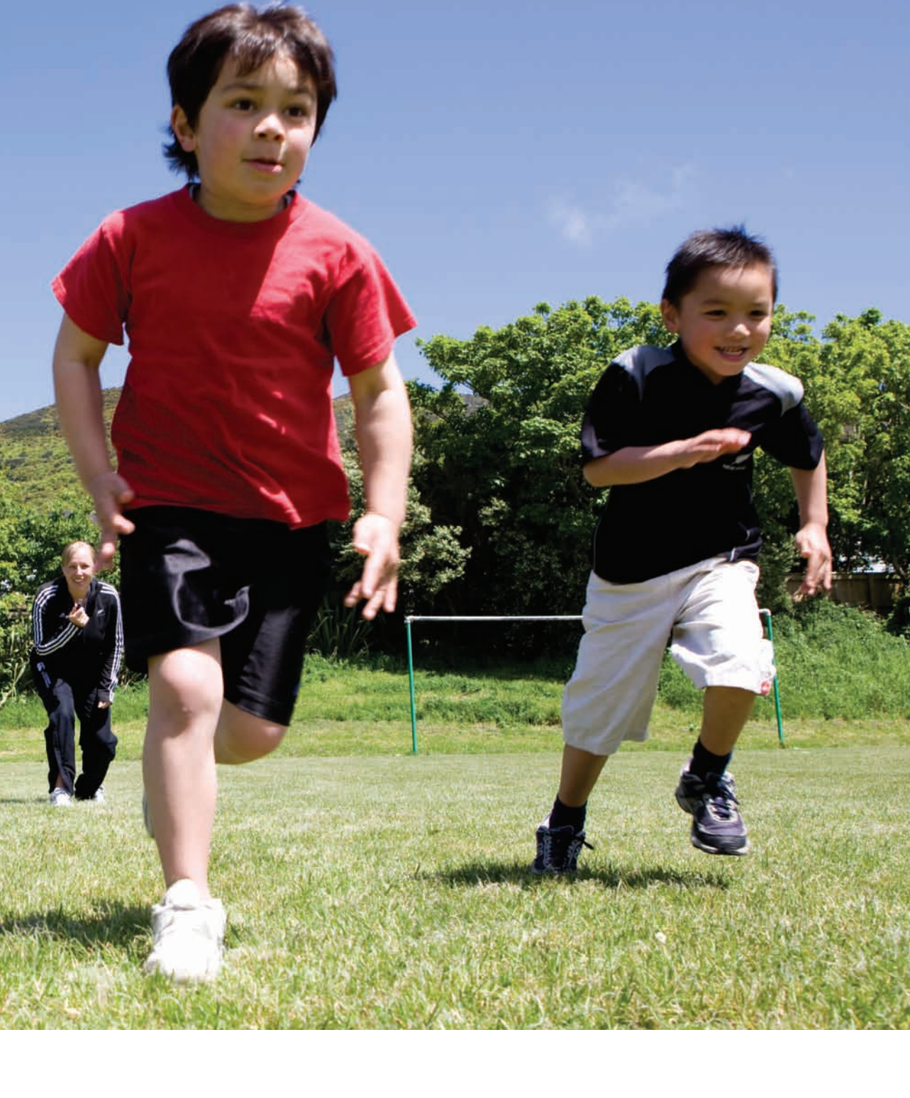
"On your marks, get set, go!"