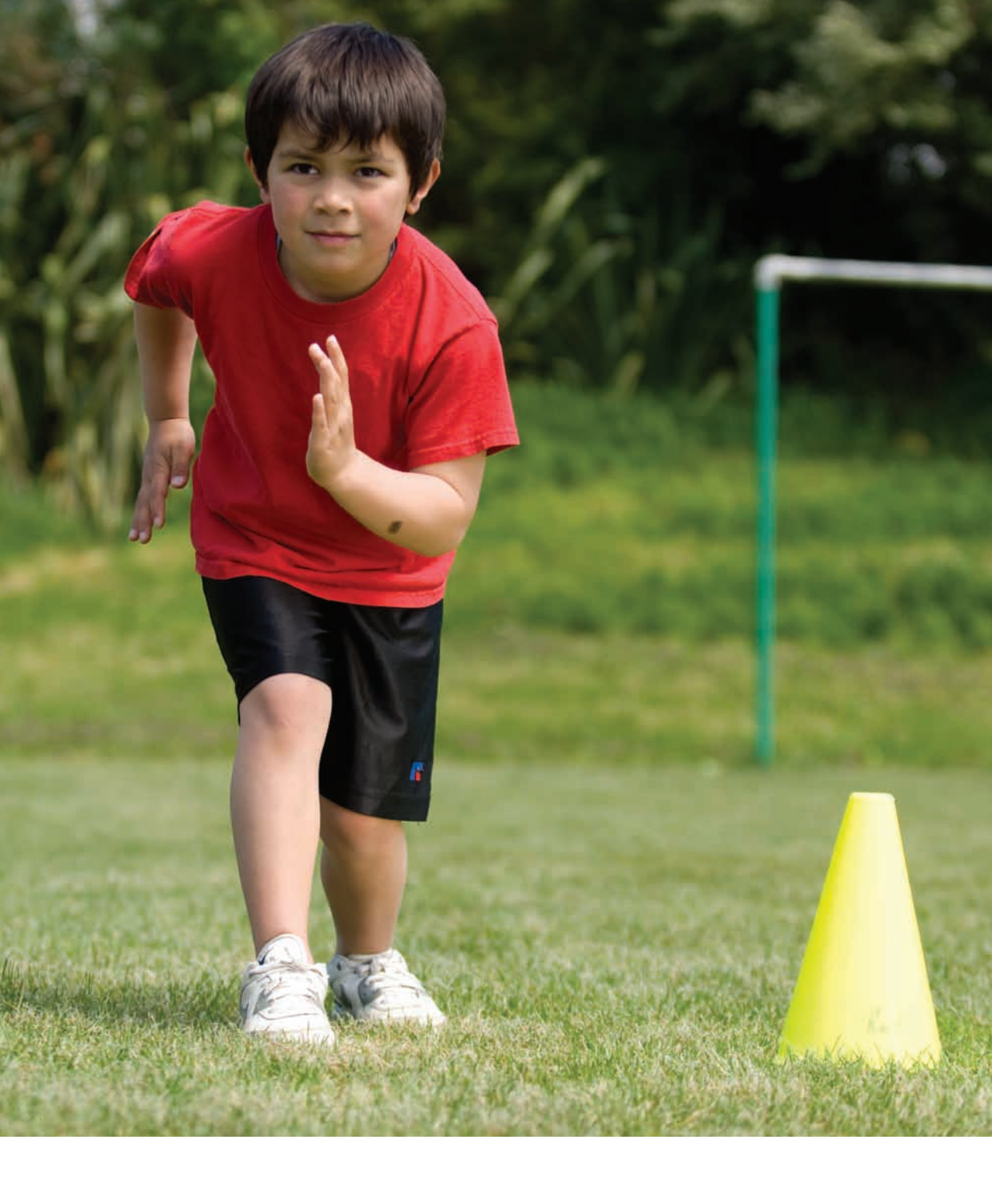
He was ready to start.